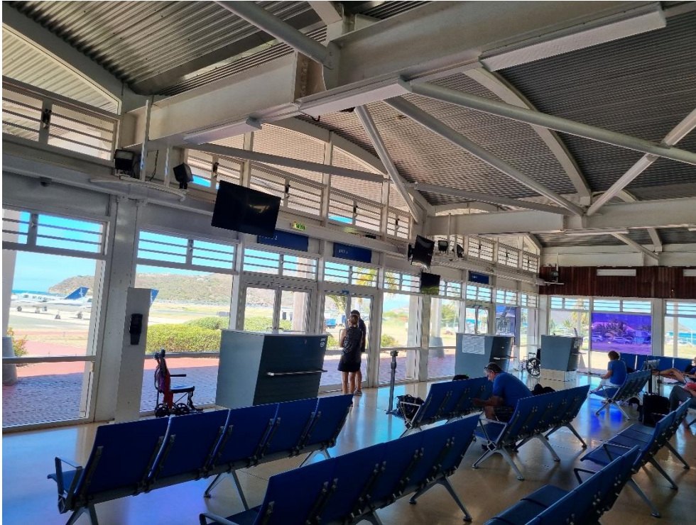
Figure 2 Departure Lounge.