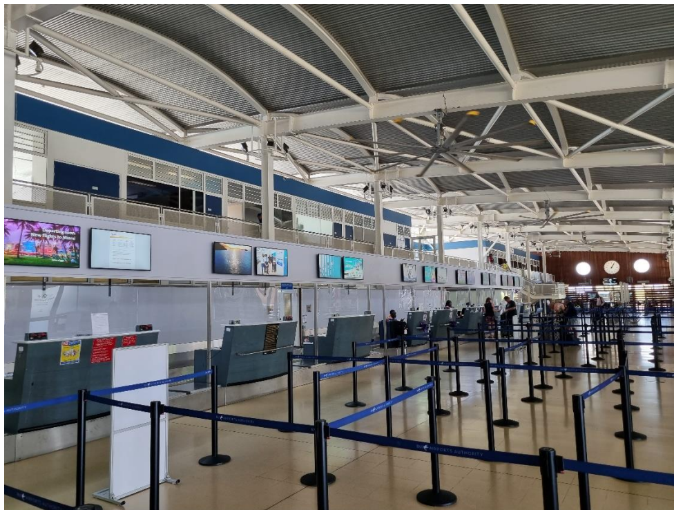
Figure 1 current check in area at Terrance B. Lettsome International Airport